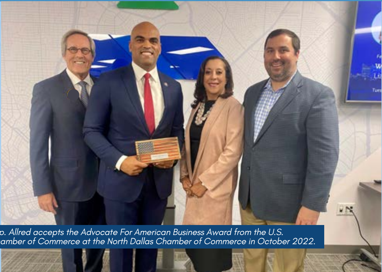
Rep. Allred accepts the Advocate For American Business Award from the U.S. Chamber of Commerce at the North Dallas Chamber of Commerce in October 2022.

Allred also received the award in 2020, formerly called the Spirit of Enterprise award, as well as the Jefferson-Hamilton Award for Bipartisanship in 2021." (People Newspapers, 10/10/21)