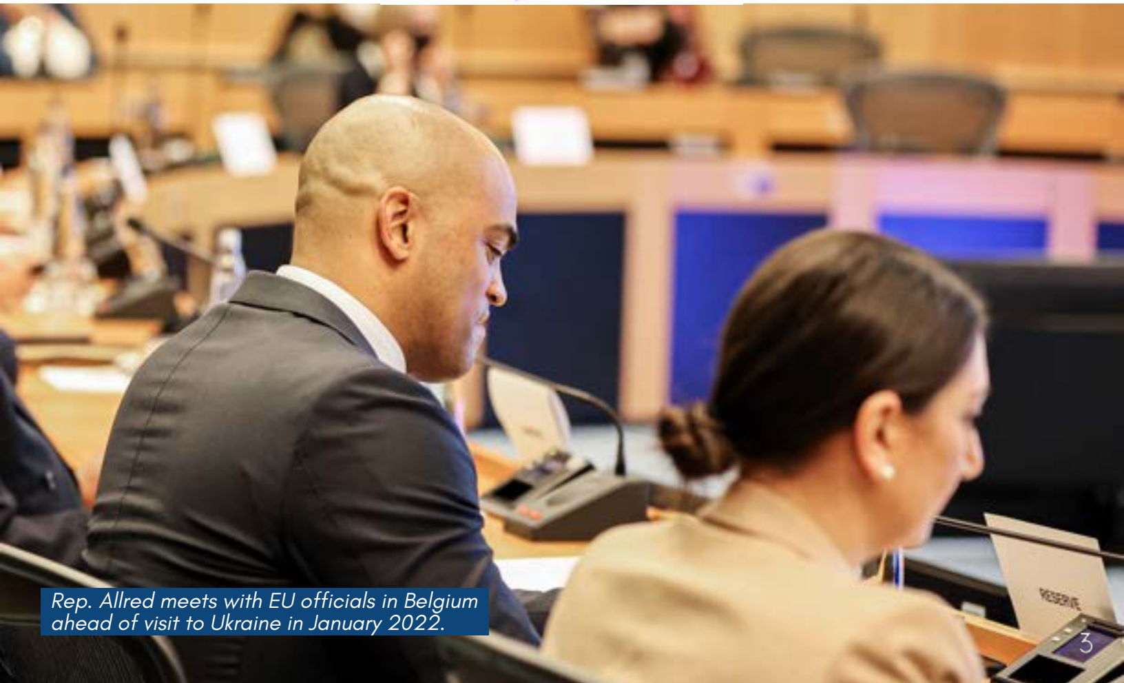
Rep. Allred meets with EU officials in Belgium ahead of visit to Ukraine in January 2022.