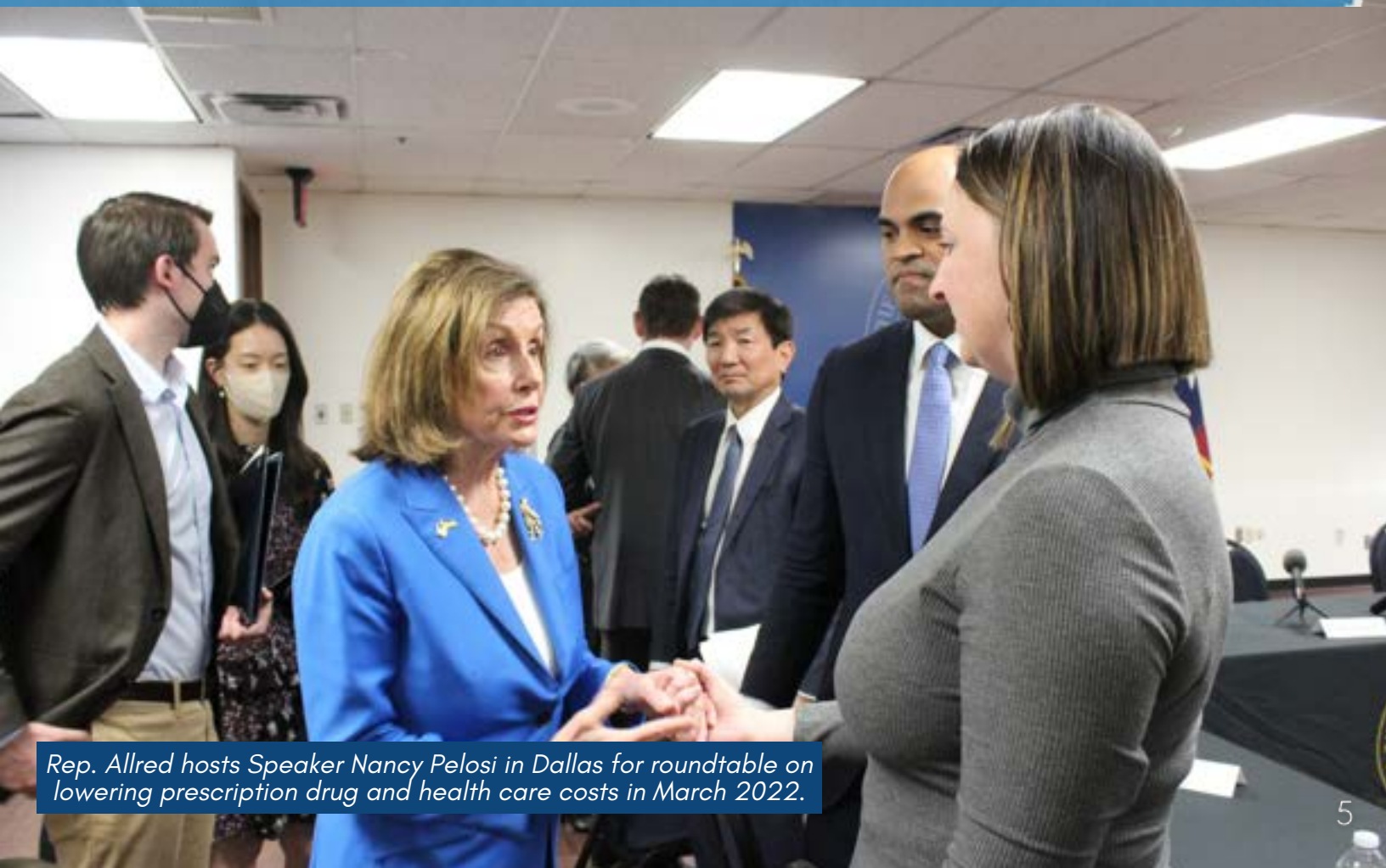
Rep. Allred hosts Speaker Nancy Pelosi in Dallas for roundtable on lowering prescription drug and health care costs in March 2022.

Democratic Rep. Colin Allred of Texas joined ABC News on GMA3 to discuss the Inflation Reduction Act, a sweeping climate, tax and health care package that the Senate passed..." (ABC News, 8/08/22)