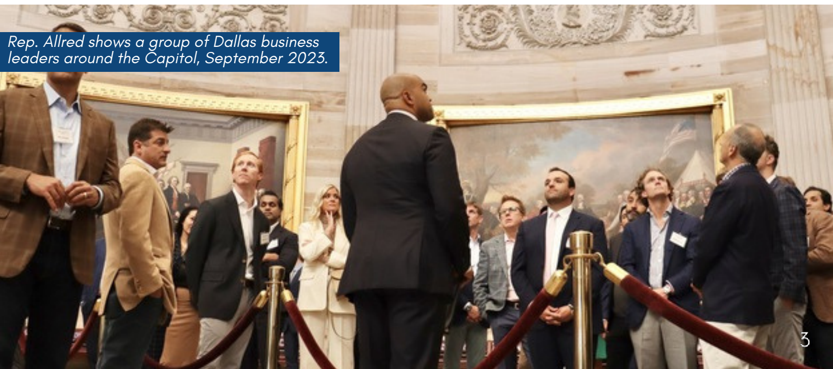
Rep. Allred shows a group of Dallas business leaders around the Capitol, September 2023.