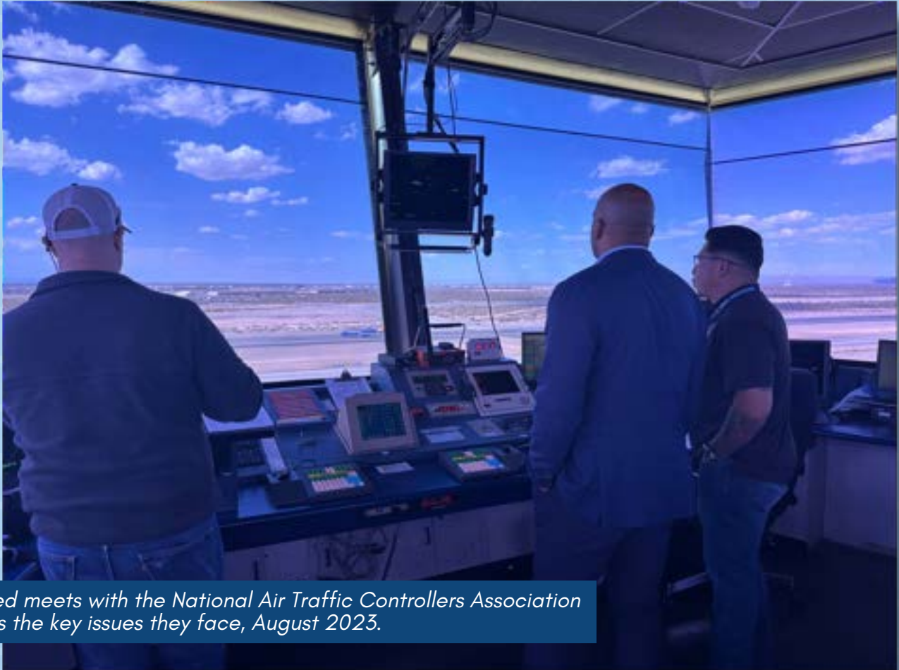
Rep. Allred meets with the National Air Traffic Controllers Association to discuss the key issues they face, August 2023.