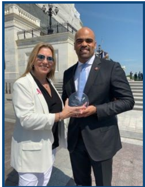
Rep. Allred touring the PediPlace facility, a non-profit dedicated to providing primary care to children and Rep. Allred with a representative from Susan G. Komen after receiving the Susan G. Komen Congressional Champion Award in 2019