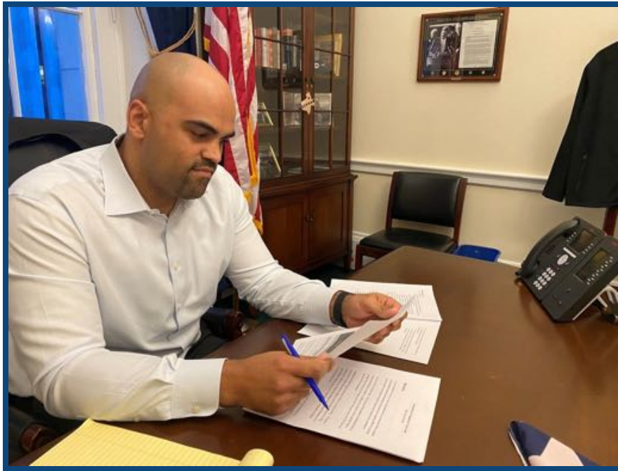
Rep. Allred before hosting a telephone town hall for constituents of the 32nd District with local officials and health experts in 2020

“Our nation must come together to fight this virus, and I am here to help all North Texans, whether you are a small business owner or are just trying to put food on the table for your family, get through this crisis.”- Rep. Colin Allred