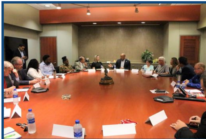
Rep. Allred with local health experts, VA leaders, and North Texans at a health care roundtable in Garland in 2019