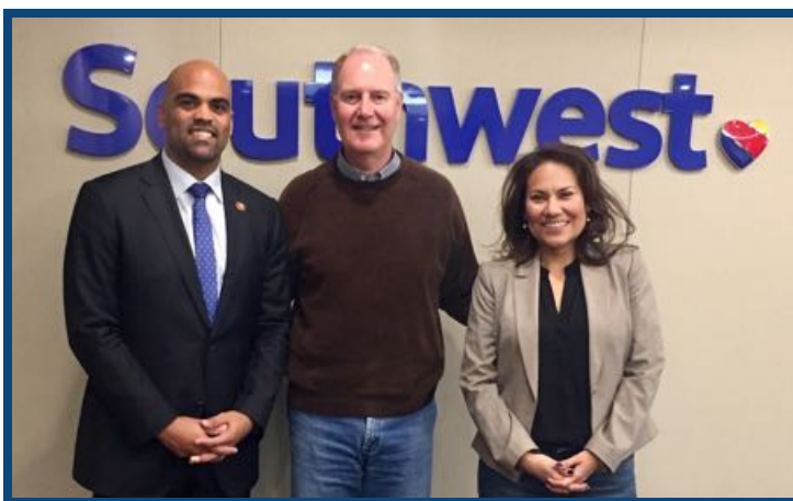
Rep. Allred visits American Airlines (left) and Southwest Airlines (right, pictured Southwest CEO Gary Kelly and Rep. Veronica Escobar (TX-16)) in 2019