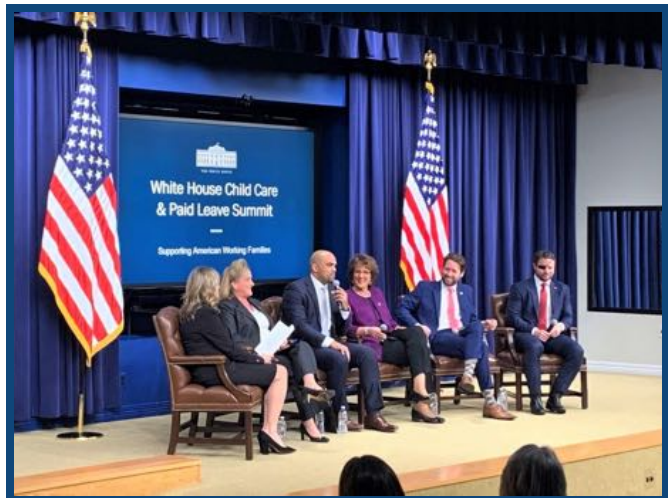
Rep. Allred with Rep. Van Taylor (TX-03) and Rep. Lance Gooden (TX-05) at the American Jewish Committee's annual meeting in Dallas and Rep. Allred at a White House Summit on child care and paid leave in 2019