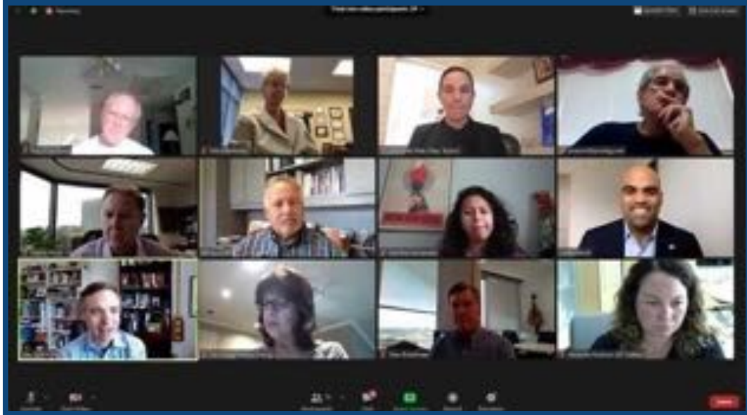
Rep. Allred with Rep. Van Taylor (TX-3) in a virtual meeting to discuss COVID-19 relief for businesses and workers with the Richardson Chamber of Commerce in 2020