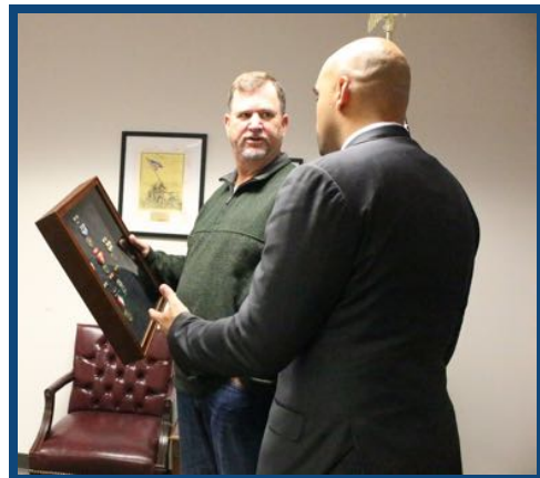
Rep. Allred with constituents who received casework assistance in dealing with federal agencies from 2019-2020