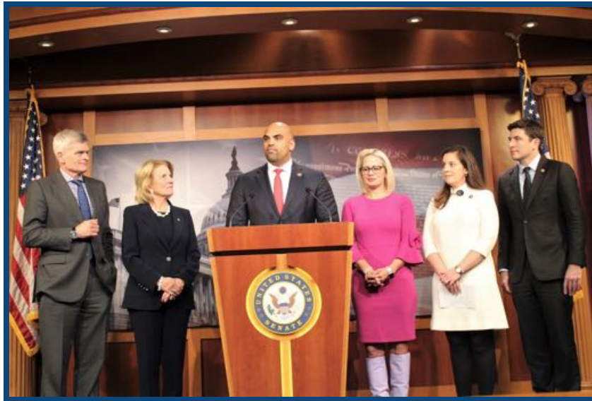
Rep. Allred with a bipartisan group of colleagues as they introduce the Advancing Support for Working Families Act in 2019

"I am as dedicated as ever to working across the aisle with my colleagues in the House to deliver real results for North Texas."- Rep. Colin Allred