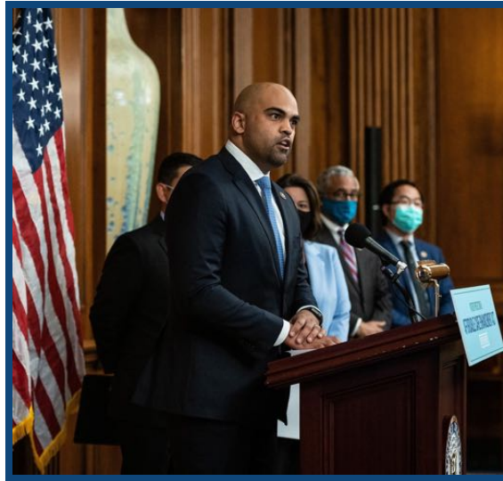
Rep. Allred speaking at a press conference with House leadership urging a vote on H.R. 1425, the Patient Protection and Affordable Care Enhancement Act in 2020

“Everywhere I go I hear stories from North Texans who need real relief from the high cost of prescription drugs. One in four people are rationing insulin because of the high cost, and one in ten adults don’t properly take their medicine for the same reason. The time for action is now.” - Rep. Colin Allred