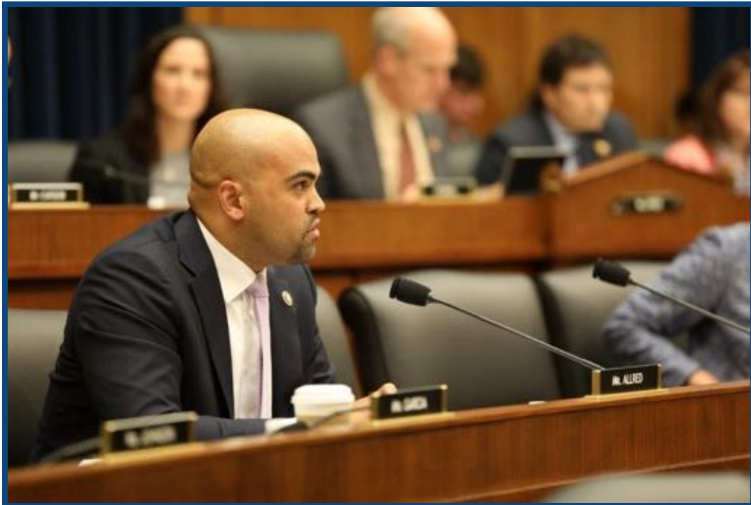
Rep. Allred questions Boeing's CEO at a hearing on Boeing 737 Max safety in 2019