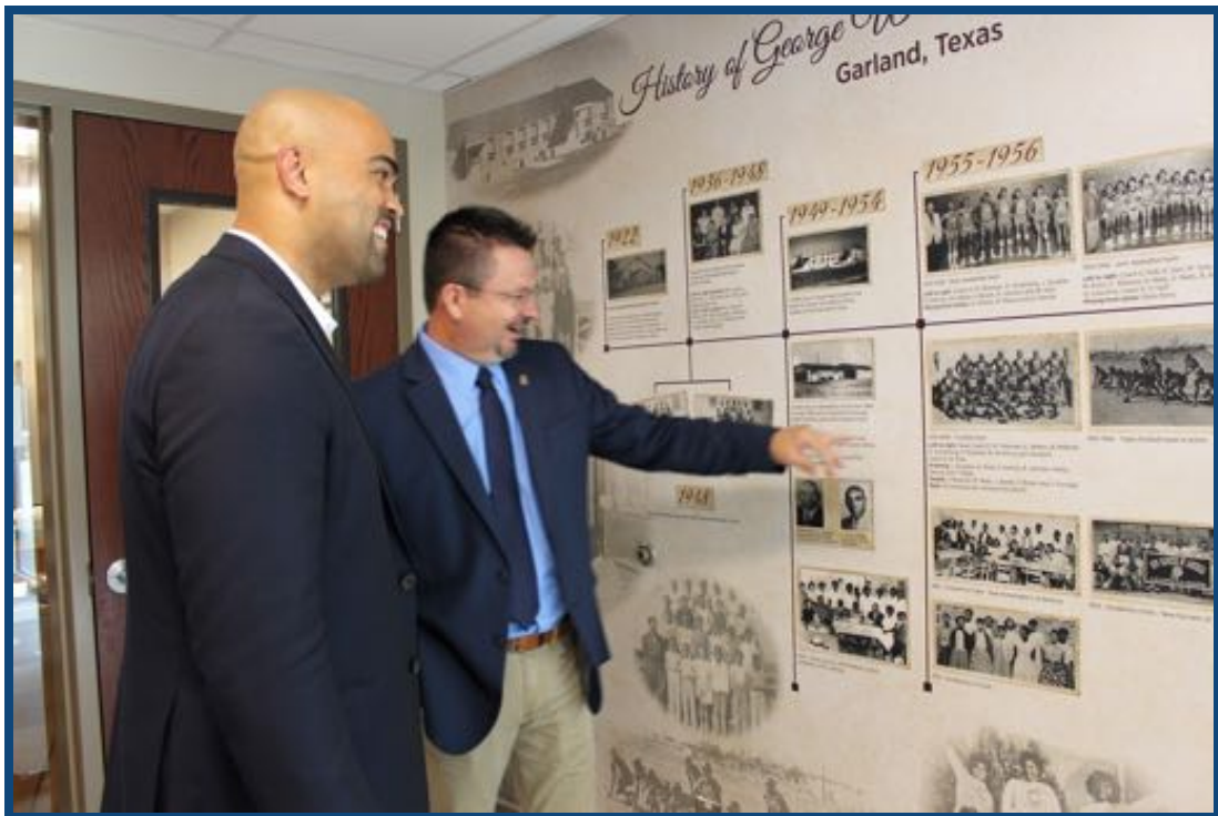
Rep. Allred at the newly-renovated Carver Center in Garland with Mayor Scott LeMay in 2019