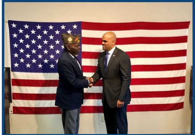
Rep. Allred listens to a local veteran at his Veterans Town Hall held on Veterans Day and at a veterans roundtable in 2019