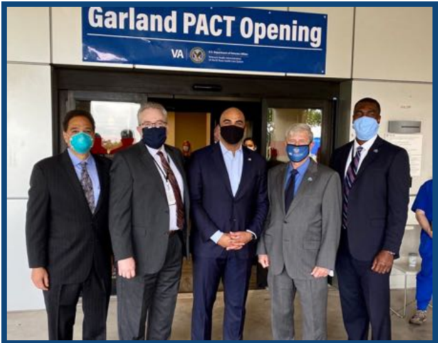
Rep. Allred with Veterans' Affairs Committee colleagues visiting service members stationed in Afghanistan and Kuwait for Thanksgiving in 2019 and Rep. Allred visiting the newly opened Garland VA Medical Center in 2020